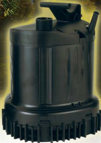
MODEL 1,430 1,430 GPH