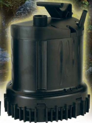
MODEL 2,780 2,780 GPH