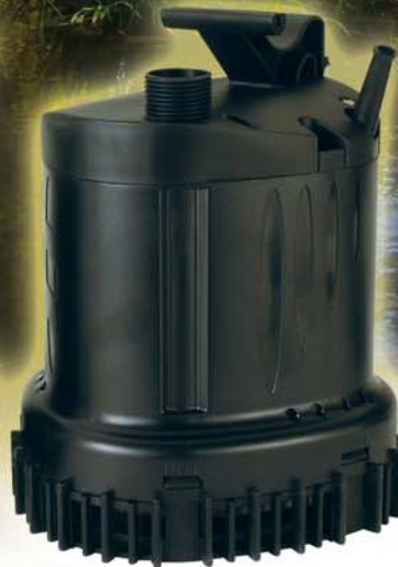
MODEL 2,100 2,100 GPH