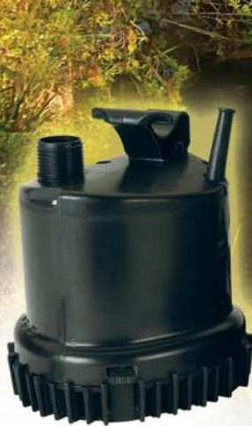
MODEL 978 978 GPH